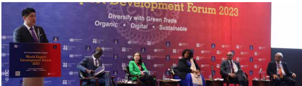
From left to right: The Foreign Policy Advisor to the President of Mongolia with panelists from BBC Africa, the Asian Development Bank, UN-OHRLS, the European Bank for Reconstruction and Development, and ITC

Executive Director, International Think Tank for Landlocked Developing Countries