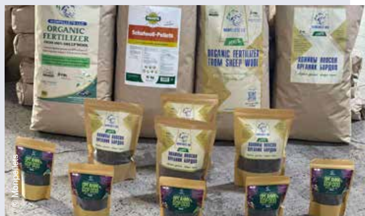
Monpellets fertilizer products, soon on-sale at Walmart and Home Depot

“We’d been exporting our product to Germany for four years. Because of COVID and the Russian-Ukraine conflict, we had not been able to send this product through to Germany. So last year we shipped for the first time to America. This year we’re sending the retail product to Home Depot and Walmart. It’s a huge market for us.”