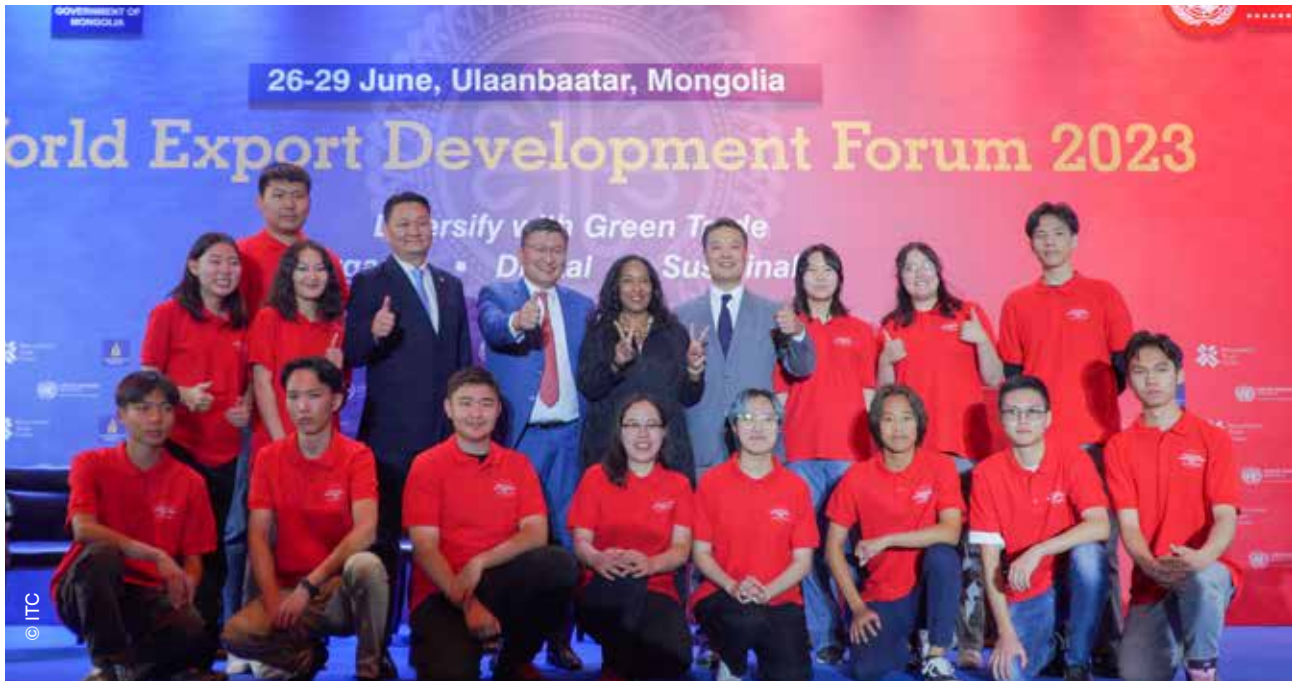
Mongolian university students of finance and economics supported WEDF 2023.