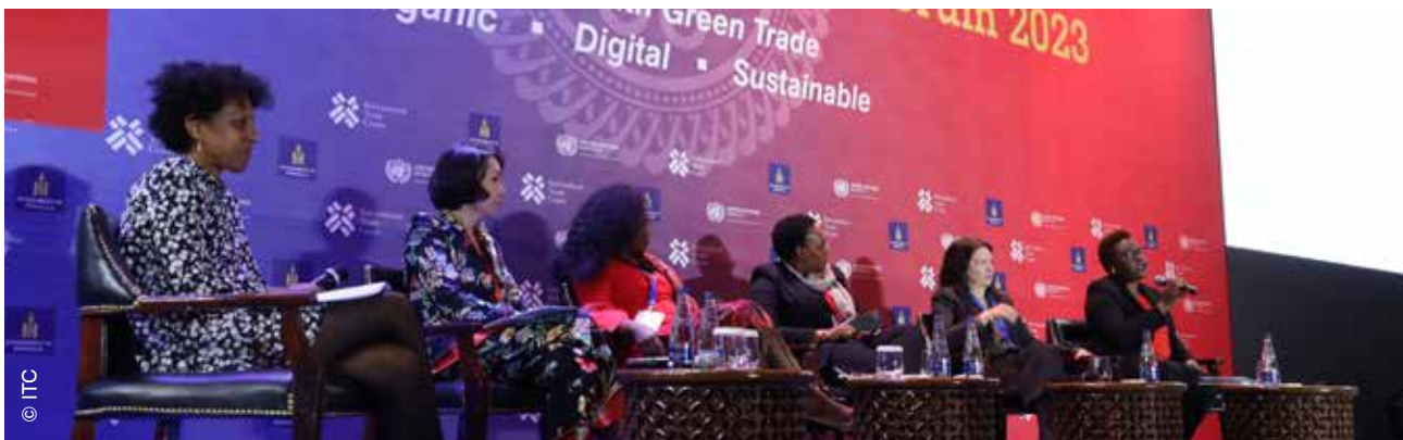
From left to right: ITC alongside the Mongolian National Chamber of Commerce and Industry, the South Africa SME Development Agency, Green Energy Rwanda, UNDP Mongolia, and the Commonwealth Secretariat

Vice President, Mongolian National Chamber of Commerce and Industry