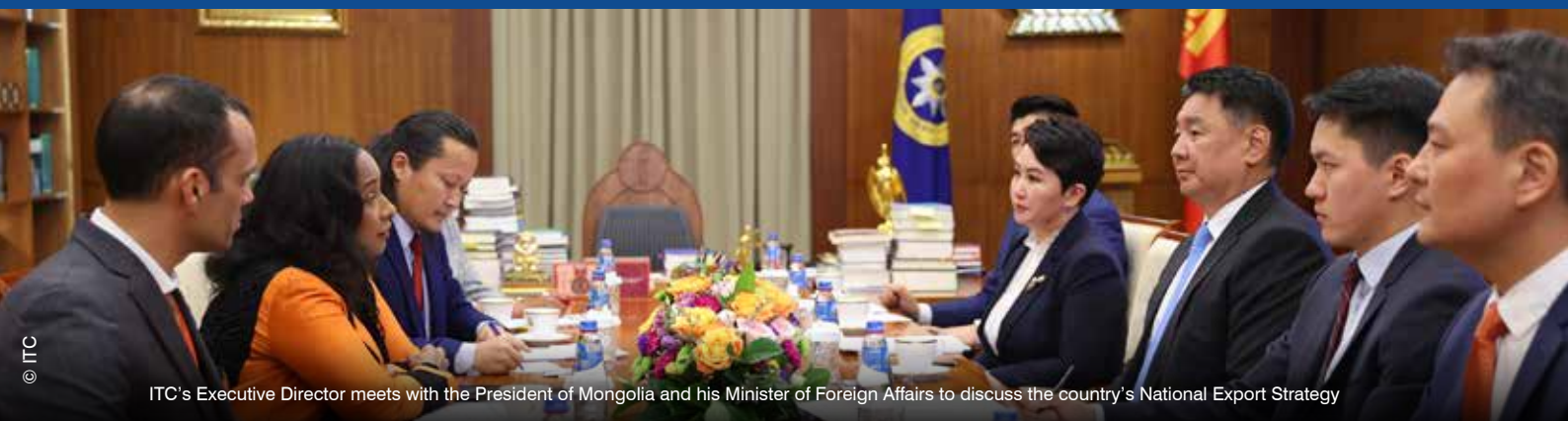
ITC's Executive Director meets with the President of Mongolia and his Minister of Foreign Affairs to discuss the country's National Export Strategy