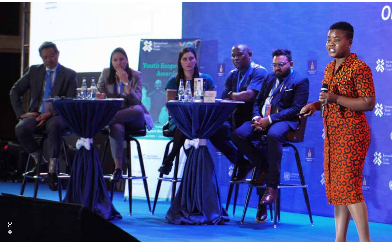
From left to right: Youth Ecopreneur Awards jurors from the World Intellectual Property Organization, the UN Convention to Combat Desertification, Sidley Austin, Zimtrade, and RecycleX evaluate a young ecopreneur’s pitch at WEDF 2023

Founder, RecycleX, India; Previous Youth Ecopreneur Awards winner