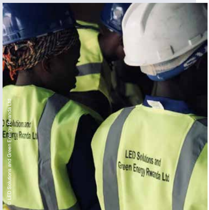
Technicians at Green Energy Rwanda’s first operational hydro power plant