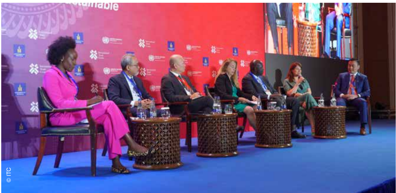
From left to right: ITC alongside speakers representing Malaysia, Vietnam, the European Union, Kenya, the Netherlands and Mongolia discuss the green future of trade

Managing Director, The Netherlands’ Centre for the Promotion of Imports from Developing Countries