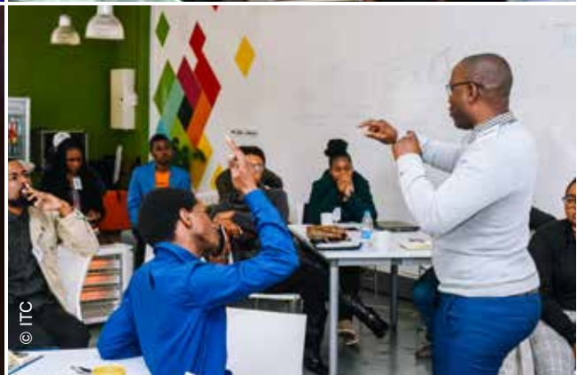
Top left photo: ITC alongside the Ye! Community advisor for Botswana, a former Young Ecopreneur Awards winner, and the CEO of Zimbabwe's Zimtrade