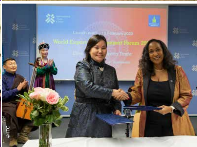
Top left photo: Traditional and contemporary musicians performed at the WEDF Gala Dinner