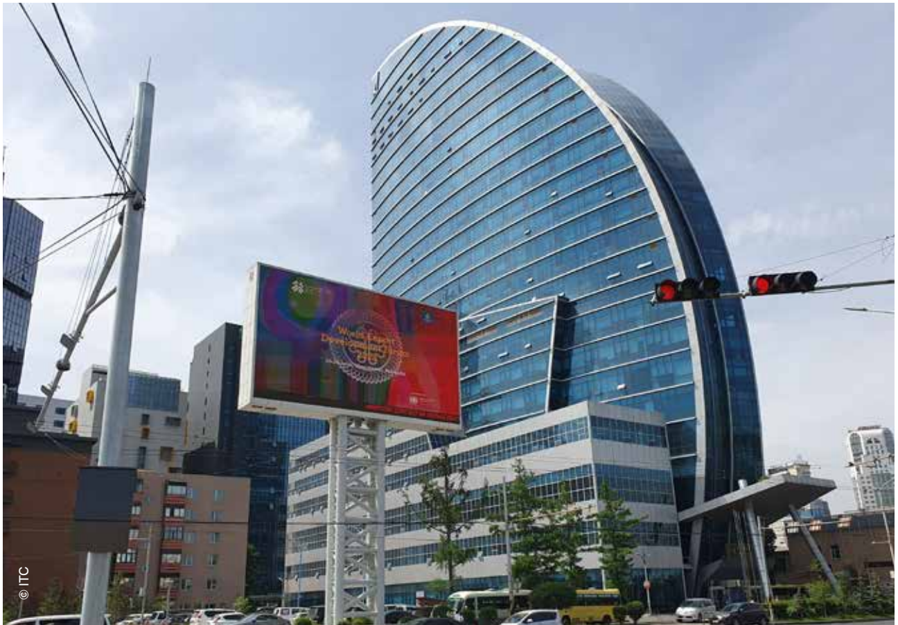
WEDF branding on display across Ulaanbaatar.