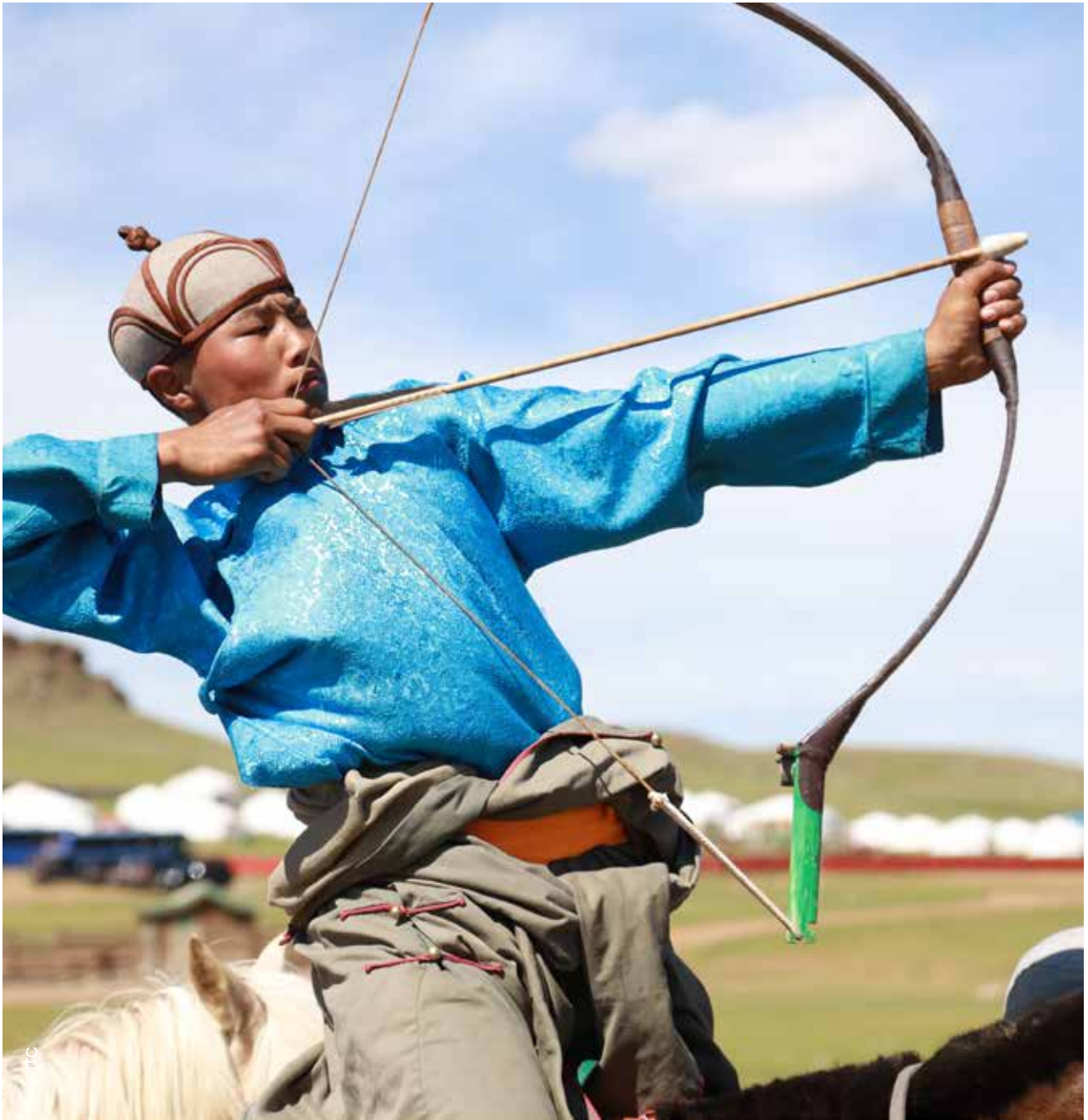
Traditional horseback archer demonstrates his skill for WEDF participants