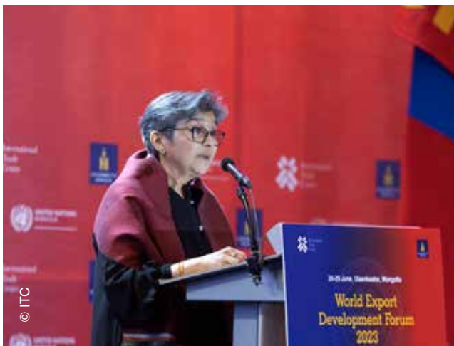
Bottom left photo: The International Think Tank for Landlocked Developing Countries served as rapporteur for the consultations