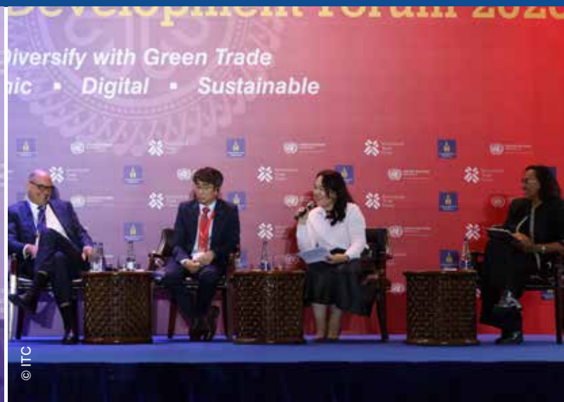
From left to right: the European Bank for Reconstruction and Development, with the Korea SME and Startups Agency, Mongolia's Khan Bank, and the African Fintech Network