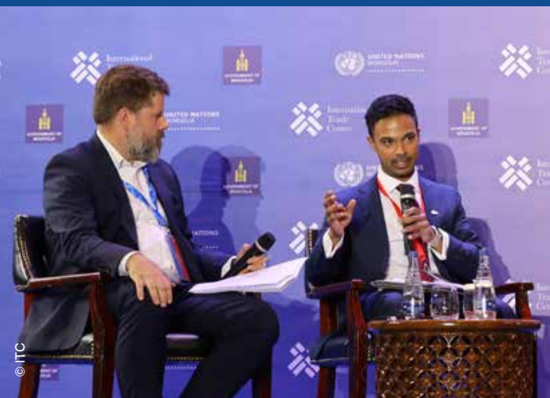
ITC alongside Trade Finance Global