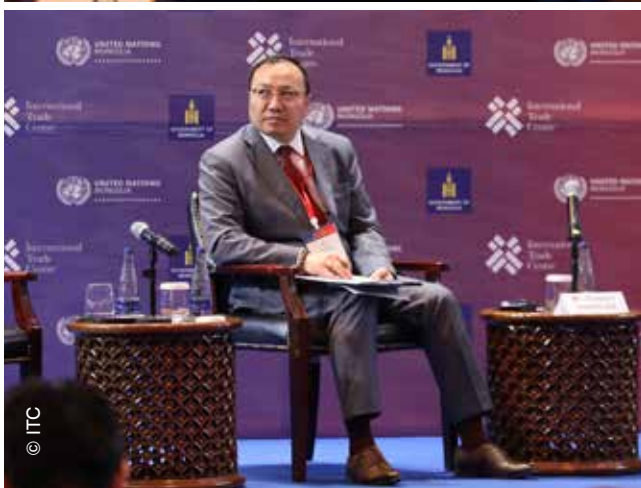
Top left photo: ITC-led roundtable discussion with businesses from Landlocked Developing Countries