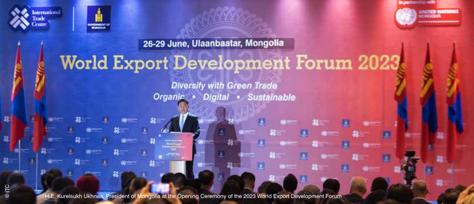
H.E. Kurelsukh Ukhnaa, President of Mongolia at the Opening Ceremony of the 2023 World Export Development Forum

Diversify with Green Trade Organic • Digital • Sustainable