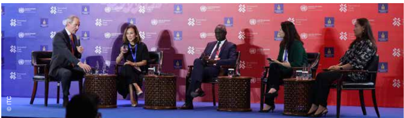
From left to right: ITC alongside the Philippines IT & Business Process Association, Senegalese tech company GAINDE 2000, China-based startup competition HICOOL, and ICT & Digital Economy Committee of the American Chamber of Commerce in Mongolia