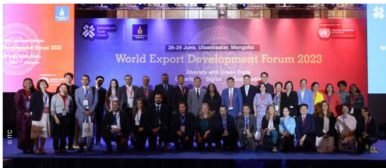
ITC staff and Mongolian government officials at the close of the World Export Development Forum