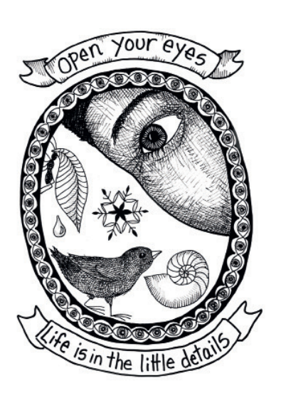
Open your eyes' by Aleta