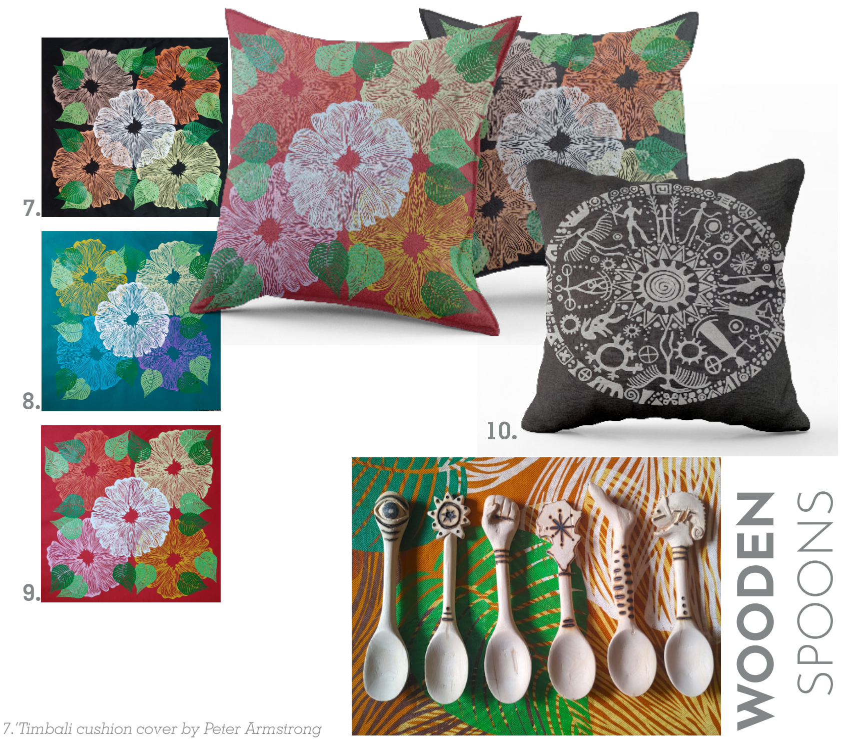
7."I'imbali cushion cover by Peter Armstrong 8."Timbali II' cushion cover by Peter Armstrong 9."Timbali III' cushion cover by Peter Armstrong 10."Trance cushion cover by Aleta Armstrong